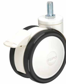
VW01605 BRAKED WHEELS