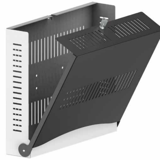
VW01603 LOCKABLE CABINET MAX.LOAD: 10 KG